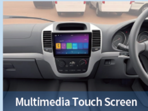
Multimedia Touch Screen