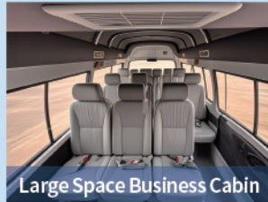
Large Space Business Cabin