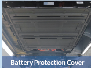
Battery Protection Cover