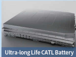
Ultra-long Life CATL Battery