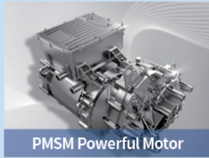
PMSM Powerful Motor