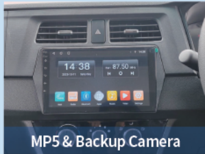
MP5 & Backup Camera