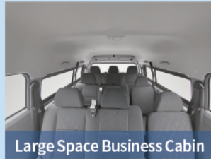
Large Space Business Cabin